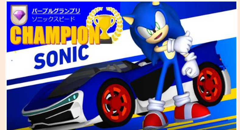
Award Ceremony (Temporary image)