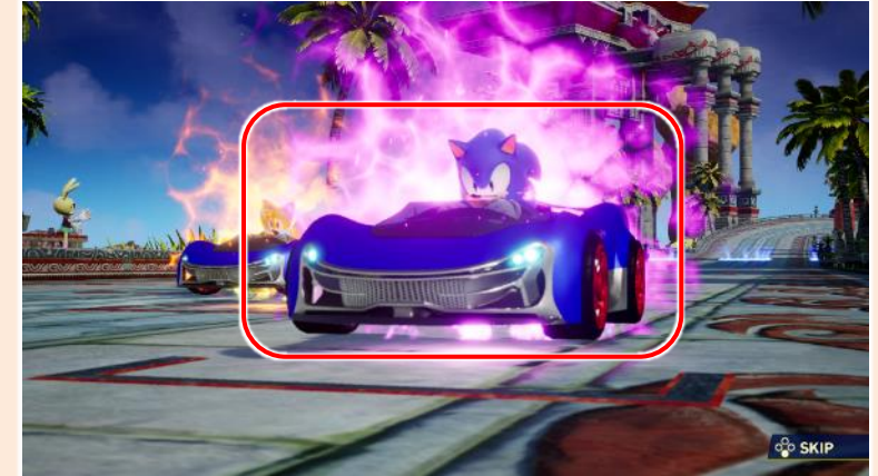
Before a Race